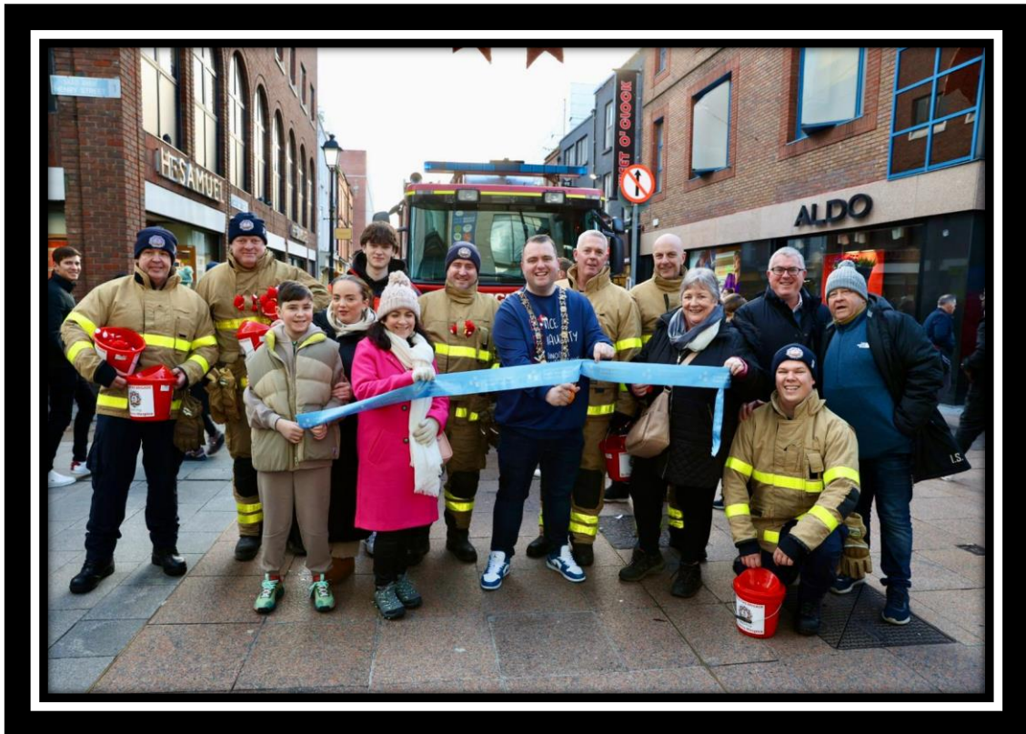
Above: Launch of the Henry Street, Christmas Market, on Sat 2 nd December with Lord Mayor Cllr Dáithí de Róiste.

The Office of City Recovery have been multiplying efforts in recent weeks in light of the awful events that took place in the City end of November. We have been working with all relevant departments in DCC ensuring the upkeep of the Public Domain within the City Centre. Our staff are auditing the streets of the City Centre daily and reporting all necessary works to the relevant departments and following up to ensure the works are completed.